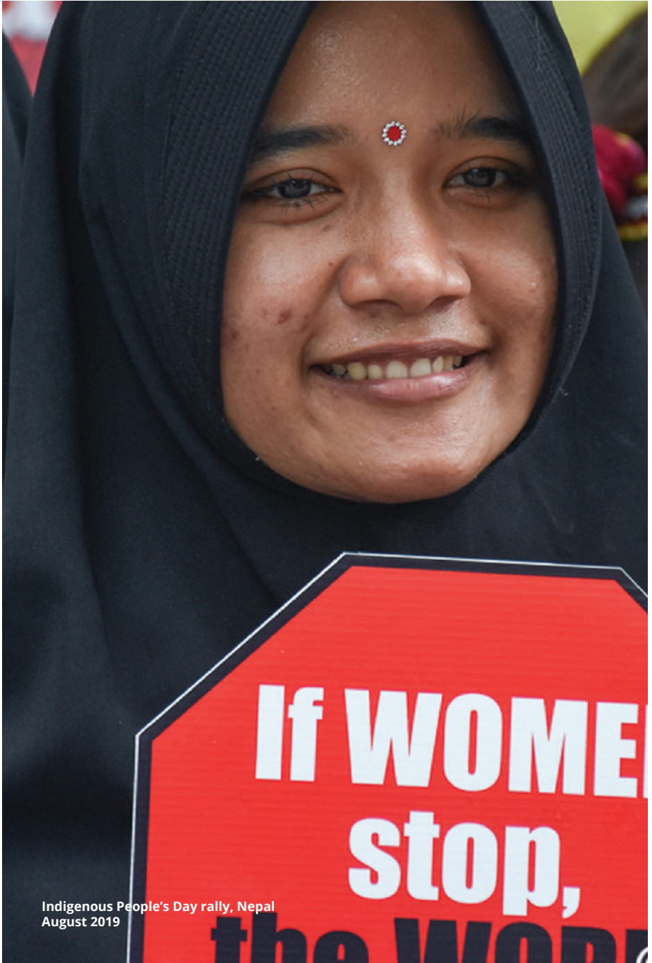
Indigenous People's Day rally, Nepal August 2019