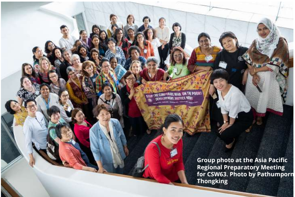
Group photo at the Asia Pacific Regional Preparatory Meeting for CSW63.

When canvassing the work of APWLD’s members, partners and allies over 25 years to shape this submission, certain elements shone through: incredible courage in the face of increasing intolerance, threats and danger; innovation and resilience in coming up with new tactics and continuing to persevere; and the wonder and power of solidarity across movements. The words of an APWLD member from 15 years ago remain true today: ‘women’s gains are a result of women’s activism’ 11 . Indeed, nothing was handed to us and every single victory for our rights is hard fought. The Beijing + 25 review cannot be a mere celebration of what was, but a moment to revive those commitments and operationalise the word ‘Action’ in the BPfA.