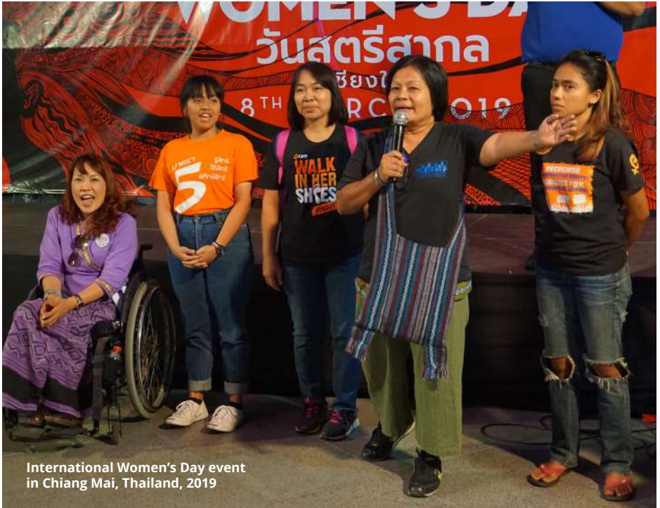
International Women's Day event in Chiang Mai, Thailand, 2019