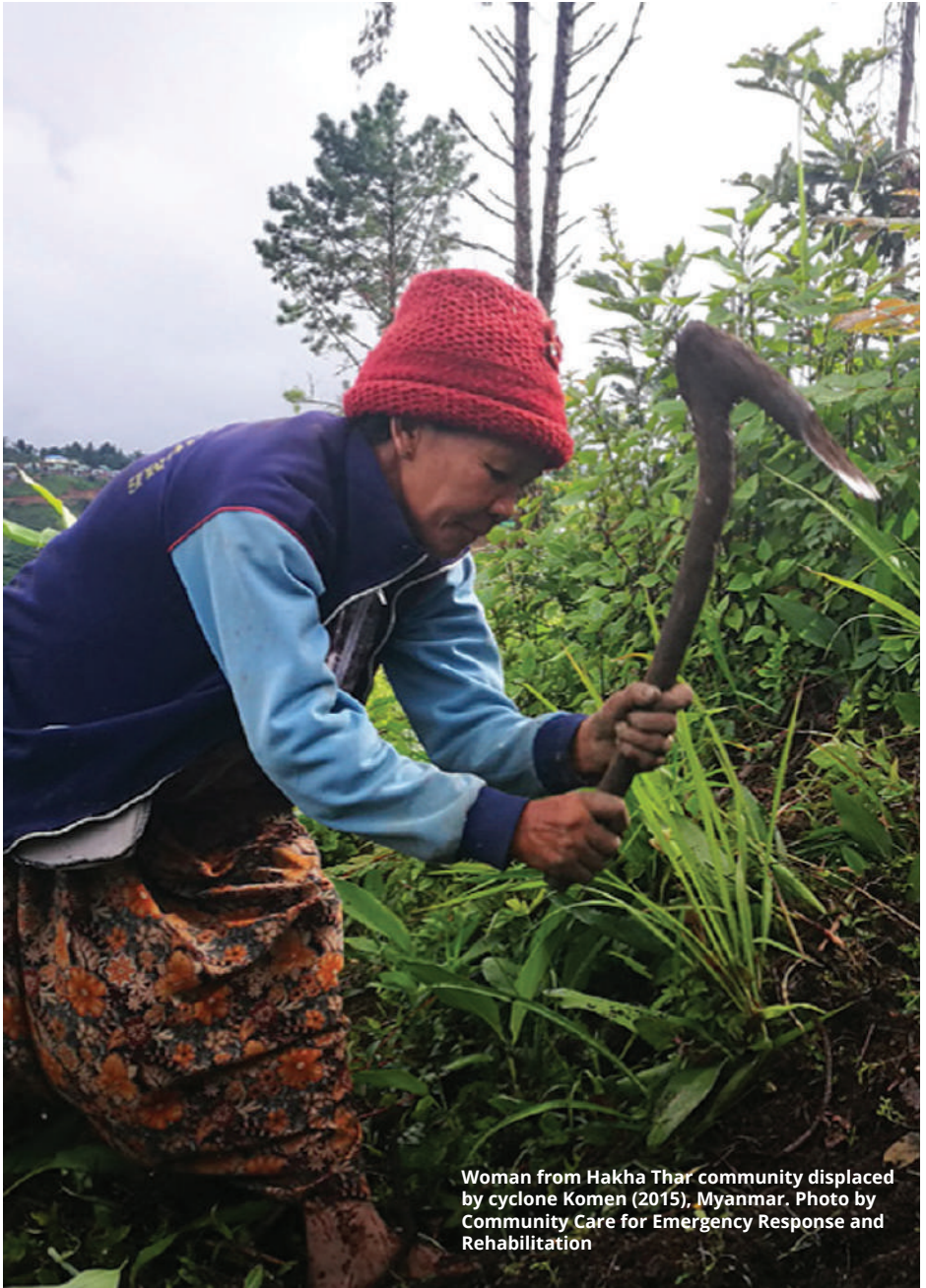
Woman from Hakha Thar community displaced by cyclone Komen (2015), Myanmar.