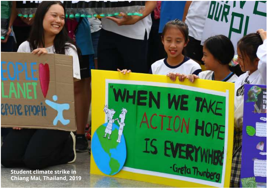
Student climate strike in Chiang Mai, Thailand, 2019